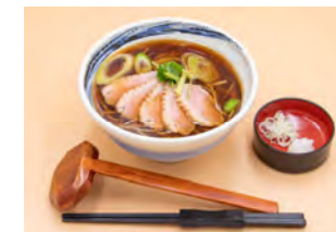
《Kamo namban Kakesoba》

Our Kake Soba is ... Home-made buckwheat noodles are boiled and served In HOT Tsuyu (fish broth)