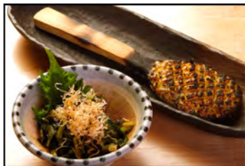
《Yakimiso & Ha-wasabi》