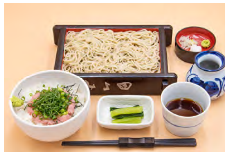
《 Miyota Set 》

Hiya-kake Oroshi Soba is served with grated Japanese white radish Daikon.