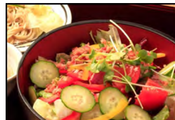
《Seasonal Mixed Salad》