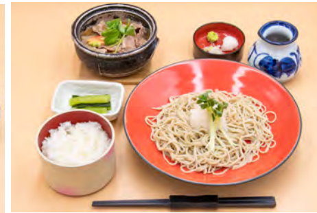
《 Shinshu Premium Beef Miso-Suki Set 》